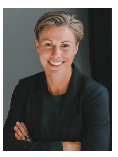
WINNI GROSBØLL MAYOR

Udgivet af Bornholms Regionskommune juli 2019. Tryk: KLS PurePrint. Cradle-2-Cradle. 100 procent økologisk nedbrydelig. CO<sub>2</sub>-neutral tryksag.