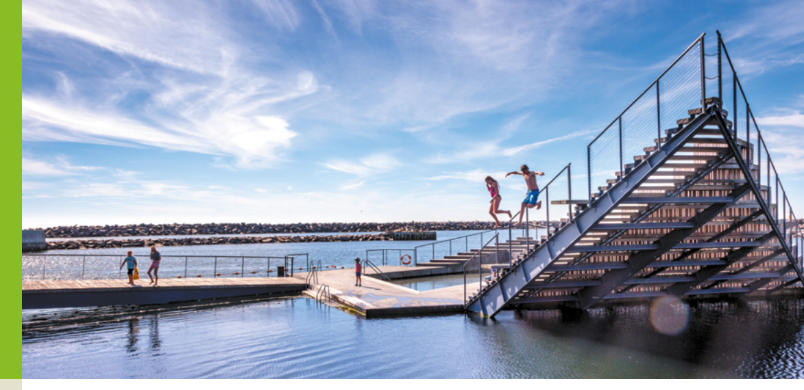
Fun and bathing at Hasle Havnebad